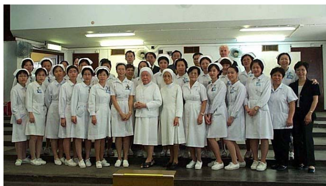
NURSES FROM ST. TERESA'S HOSPITAL